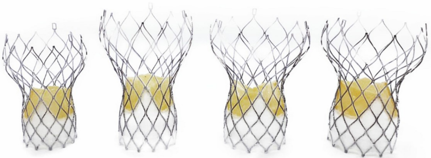
23 mm Valve

Aortic stenosis in patients at medium to high risk for open heart surgery. The minimal invasive heart valve replaces the native valve without the need for concomitant surgical removal and is placed via the femoral access. The new generation comes fully premounted with specially prepared bovine pericardium , thus reducing the time of the procedure and the preparation steps.